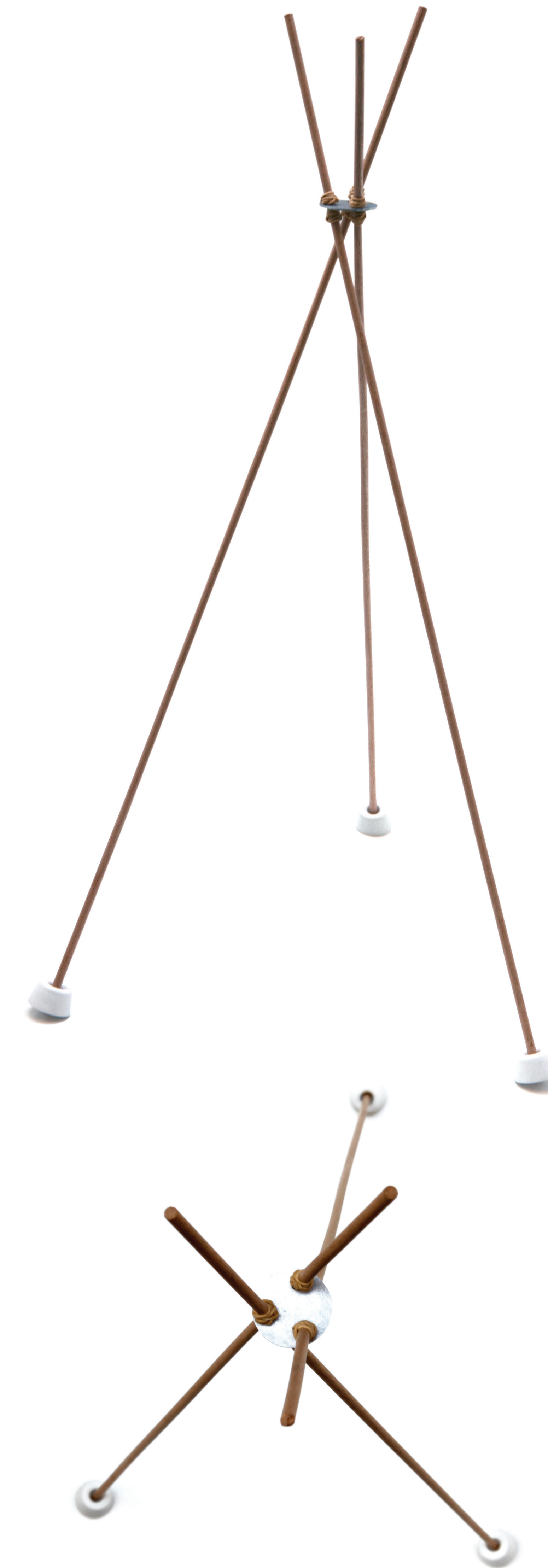
simple form | construct with 3 sticks

So we decided to make a clothes drying rack for indoor as well as for outdoor which solves the present problem. We did research on behaviour and process of washing clothes in different countries.