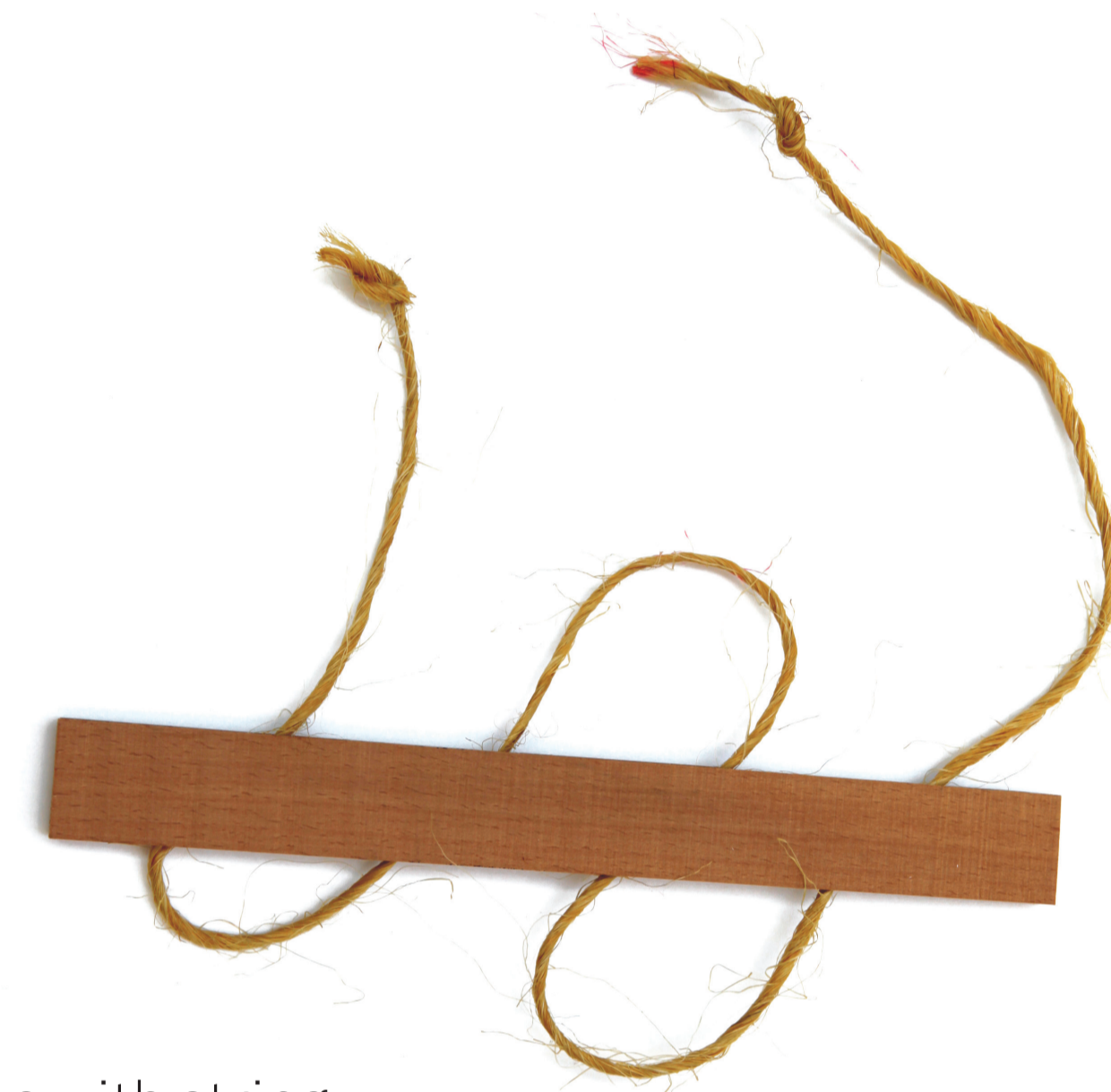
hooks with string