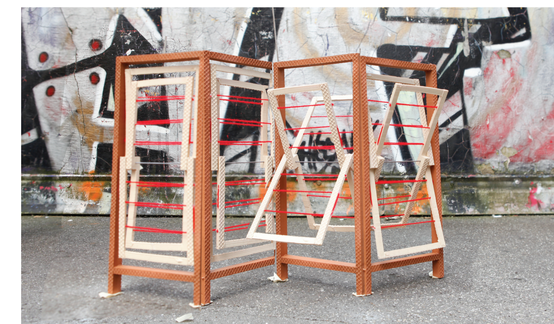
rack | screen | room divider