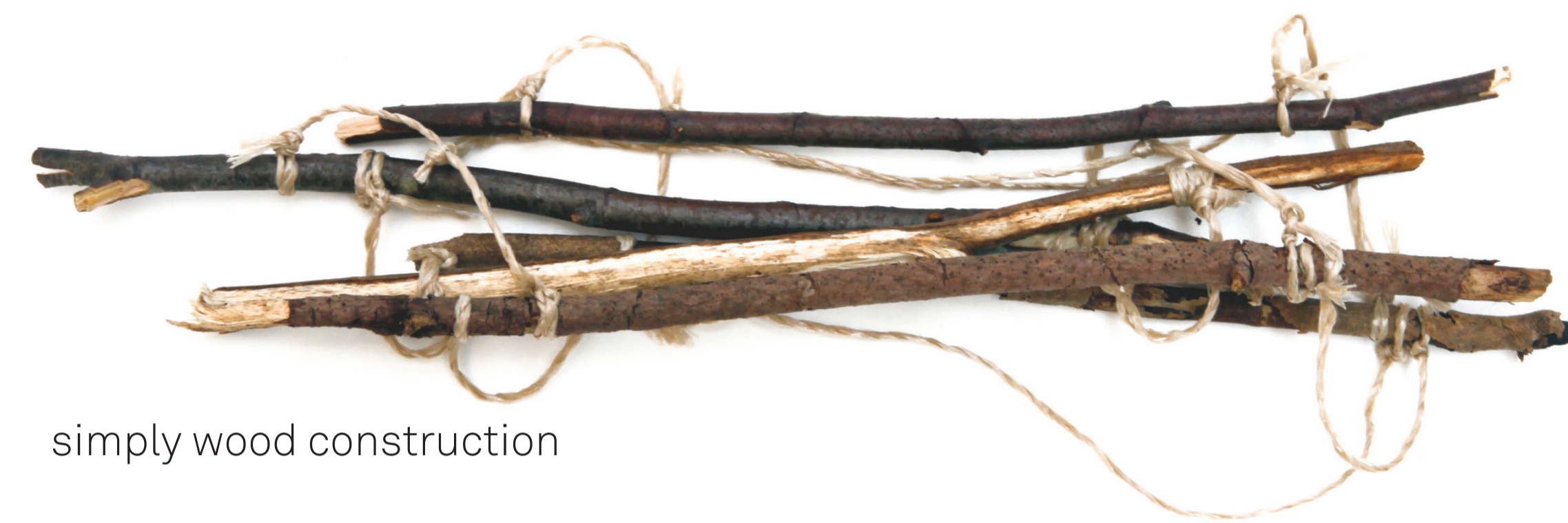
simply wood construction

use during day time use during night time