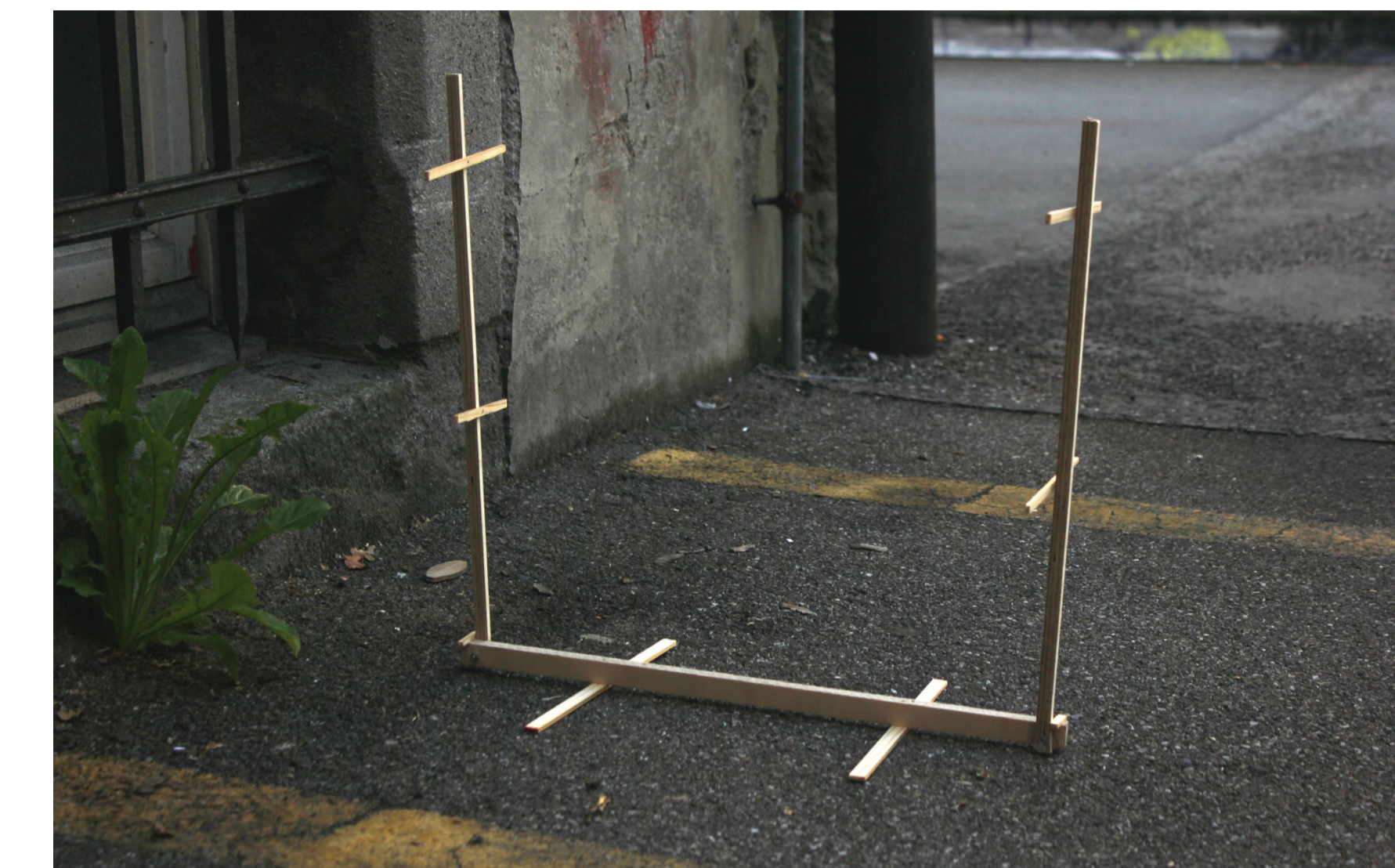
collapsible rack | open