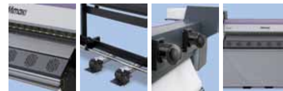
1. Drying fan 2. Exhaust fans 3. Rear fans 4. Exhaust curtain "Drying and exhaust unit" includes all of 1, 2, 3, and 4.